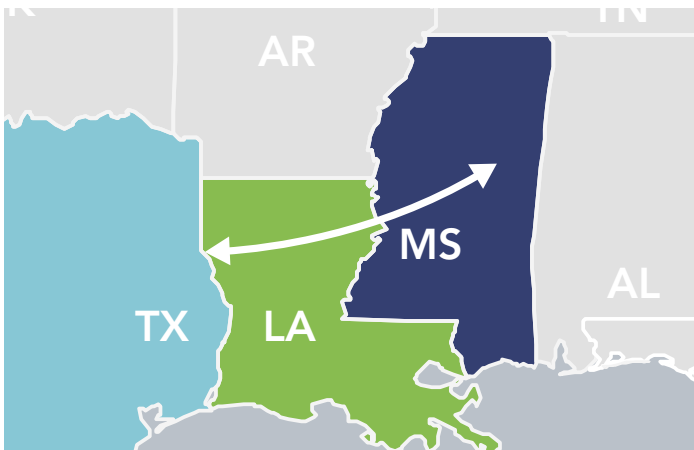
Southern Spirit Transmission will connect Texas and Southeastern transmission grids

Privately funded by Pattern Energy, Southern Spirit represents a more than $2.6 billion dollar investment and will serve as a long-term asset to the region.