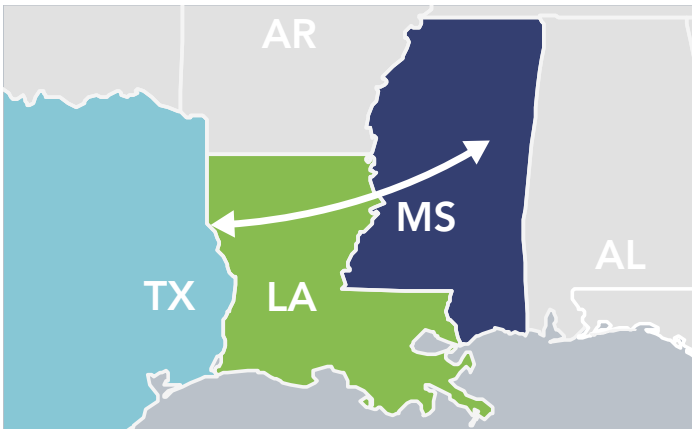
Southern Spirit Transmission will connect Texas and Southeastern transmission grids

The project is being privately funded by Pattern Energy and is projected to deliver consumer savings across regions.